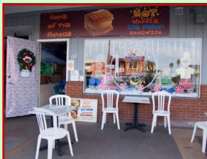
Lighthouse Ice Cream 2nd Place Most Whimsical