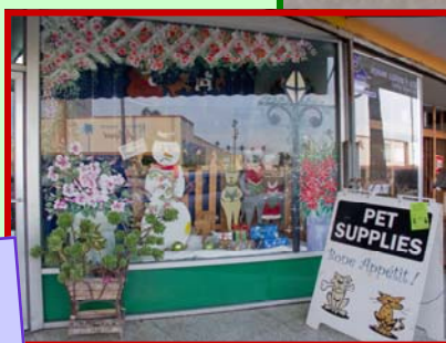
Bone Appetit Pet Supply Store 4th Place - Best Painted Windows