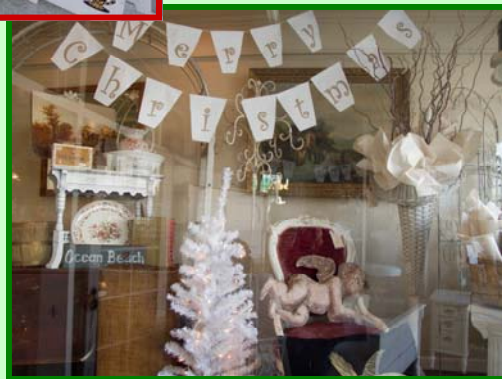
Cottage Antiques 1st Place - Best Theme