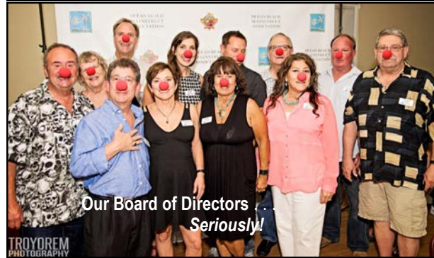
Our Board of Directors Seriously!

It was a great night! As State Speaker of the House, Toni Atkins wrote "What a fun wonderful, upbeat event!" We wholeheartedly agree. Red-noses adorned attendees as we pledged allegiance to OB and posed for photos. See all the awardees on page 3 and 4.