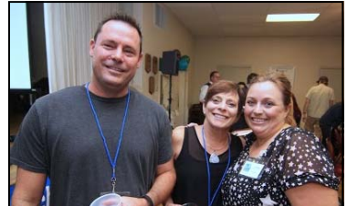
See page 5 for more

As always, we were so happy to have a great night to celebrate so many terrific contributions to the business community. Thanks to everyone who made a contribution of time, service, food and money to help make the event a success! and a good time was had by all!