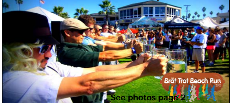
Brat Trot Beach Run 2012