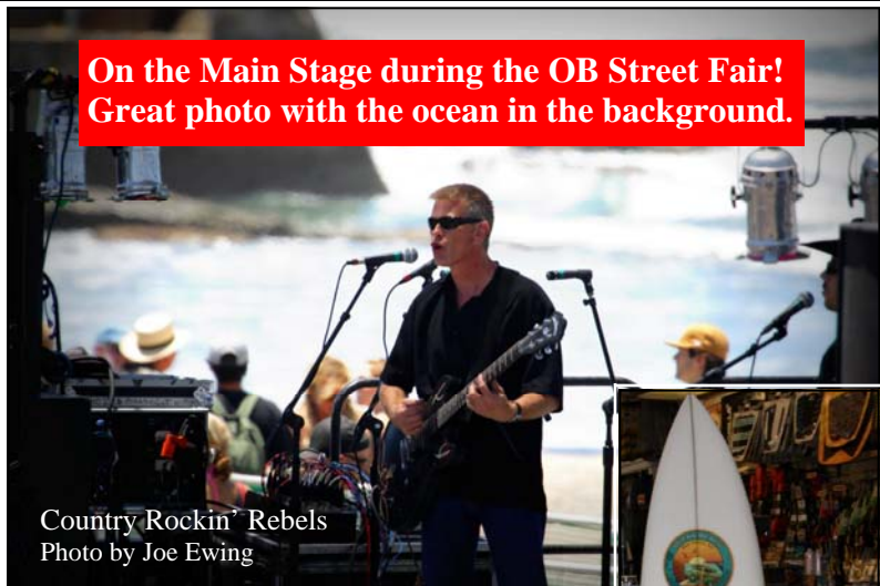
On the Main Stage during the OB Street Fair! Great photo with the ocean in the background.

Twitter: http://twitter.com/OceanBeachCA Facebook: http://facebook.com/obma92107