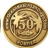
Commemorative Coin $10