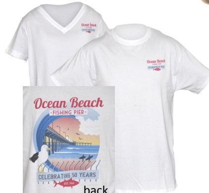
Ladies' & Men's T-Shirts $20