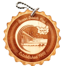
Wooden Keychain/ Bottle Opener $8