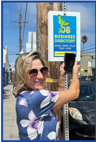
Scan QR Code and search the OBMA Business Directory

The Ocean Beach MainStreet Association installed over 100 OB Business Directory signs throughout the downtown business district, Sunset Cliffs Blvd. & Voltaire Street.