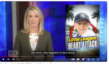
>Click to watch how an AED saved a young athlete's life

Post Office Box 60534 | San Diego, California 92166 | (619) 788-4208 ThePeninsulaAlliance.org | info@thepeninsulaalliance.org