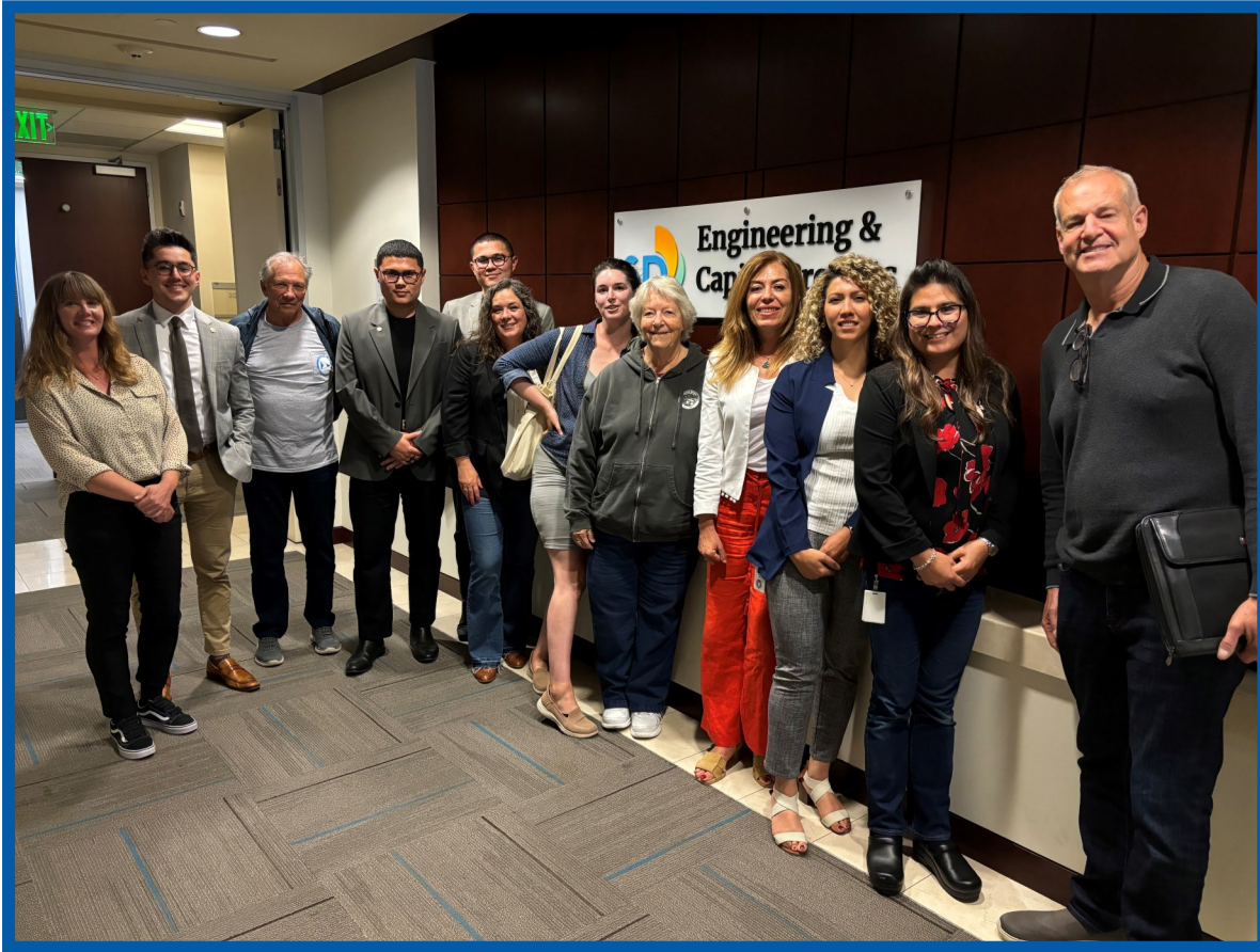
Ocean Beach Pier Working Group with City Staff · June 2024

When we hear more news about the pier we will post immediately. Currently the contractors and City departments are compiling all the information from the last workshop.