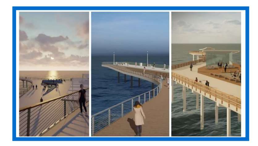
Checkout the design options and keep up-to-date with the OB Pier Renewal Project. OBPierRenewal.com

Officials say it could possibly open in spring 2024. We are hoping to get it opened sooner than that.