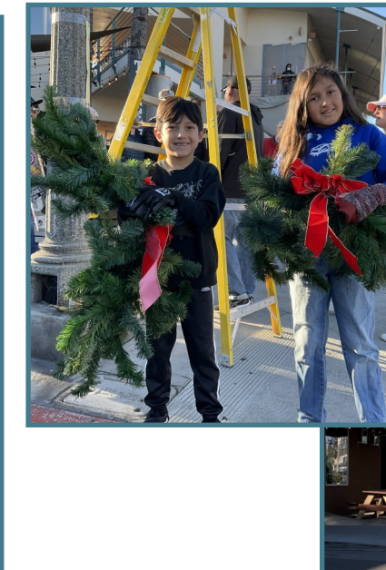
A huge thank you to Submerge Church, Rest & Relax Real Estate and Service Kings for providing lots of volunteers.