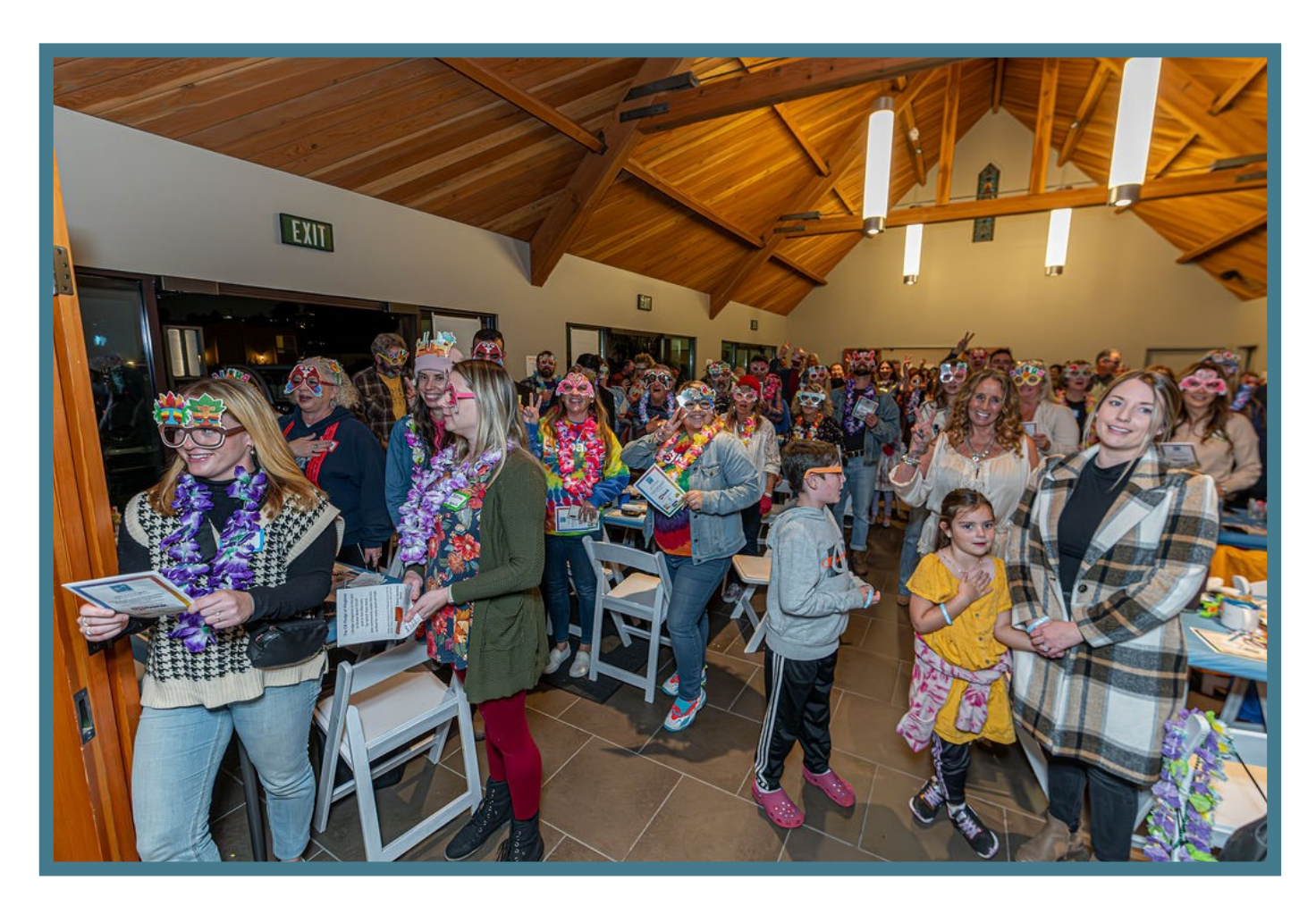
OB Pledge of Allegiance

A great time was had by all! We loved having the event at St. Peter's by the Sea. It's a beautiful facility. A big thank you to everyone who volunteer. A special shout out to those who stayed and cleaned up after the event.