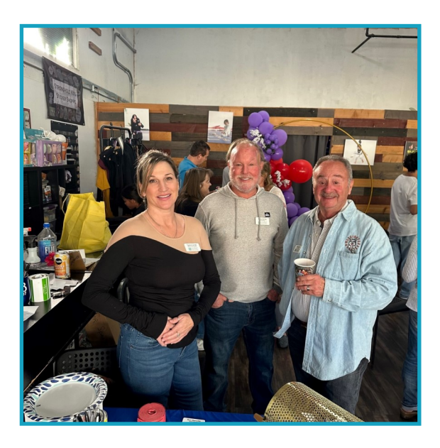
April Sundowner @ OB BBQ House Thursday, April 25th @ 5:30pm • 5025 Newport Ave .