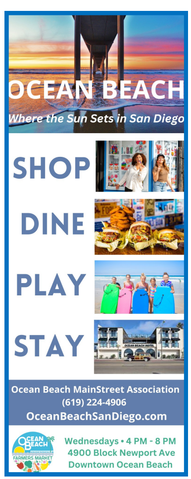
The OBMA provided our members with numerous cooperative advertising opportunities throughout FY23.