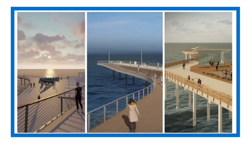
Checkout the design options and keep up-to-date with the OB Pier Renewal Project. OBPierRenewal.com

Officials say it could possibly open in spring 2024. We are hoping to get it opened sooner than that.