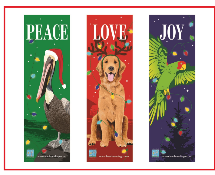
The holidays banners are up throughout downtown Ocean Beach & Sunset Cliffs Blvd.