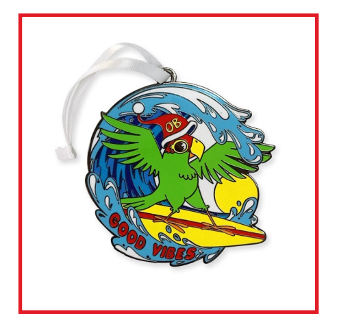
2023 OB Holiday Ornament Surfing OB Parrot On Sale Now at OBMA • $25

OB Town Council Holiday Food & Toy Drive December 11-16