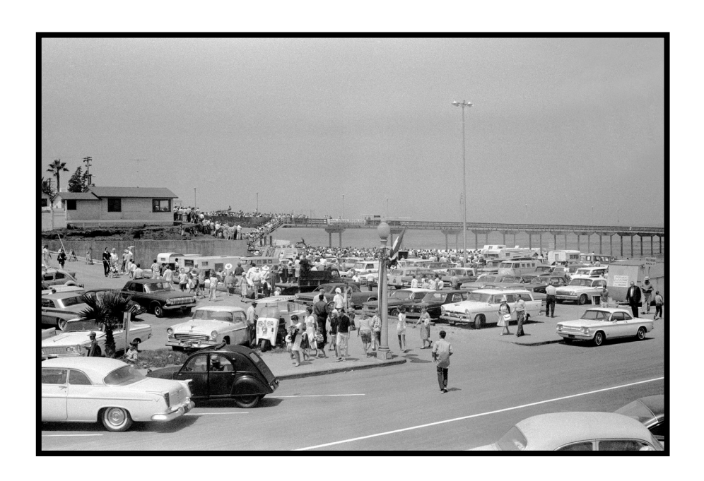
at the opening and dedication of the OB Pier on July 2, 1966.

A celebration of life will be held at Robb Field on Sunday, August 13, 2023, from 4 pm to 6 pm.