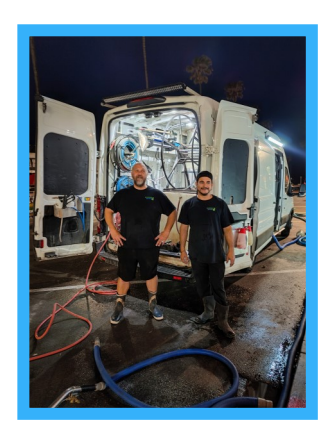
Click here to see the full schedule>

The OBMA would like to hear your feedback regarding the Sidewalk Beautification Initiative! We're thrilled to be able to provide this initiative with funds raised through events managed by the OBMA. EcoClean services has been powering-washing and sanitizing either the north or south side of Newport Avenue and parts of Abbott, Bacon & Cable weekly as part of the Sidewalk Beautification Initiative.