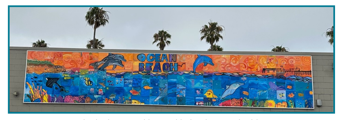
2023 Think Blue mural located behind Target building.

Thank you to our sponsors Submerge Church & Think Blue San Diego!