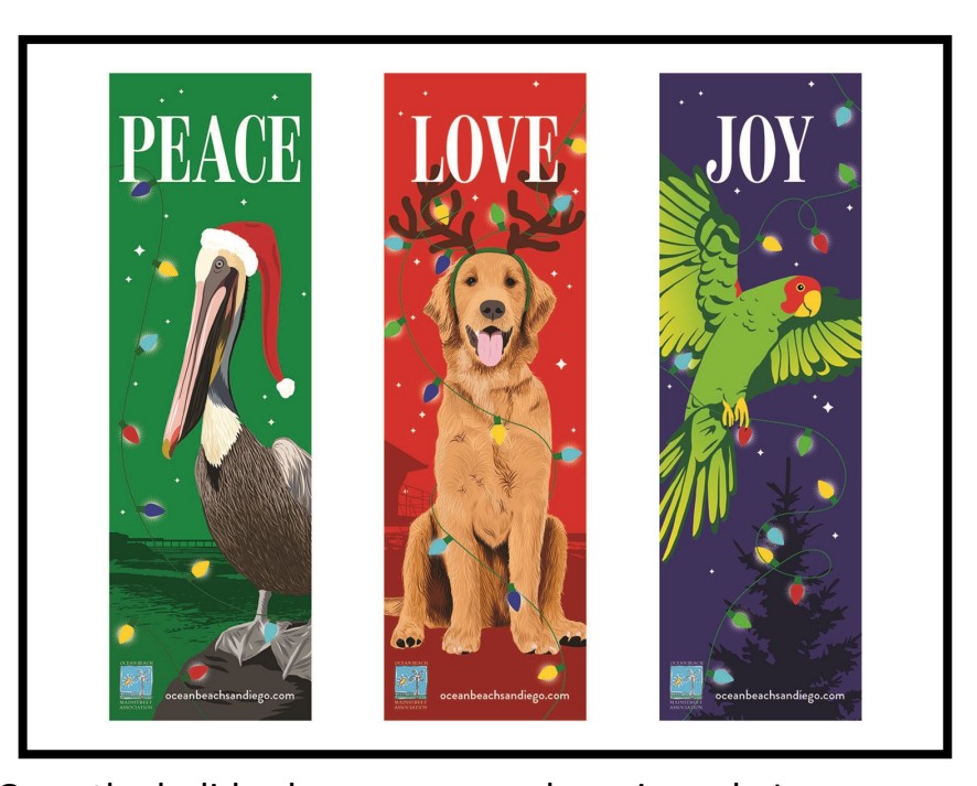
Once the holiday banners come down in early January, the 2023 holiday banners will go up.

The size of the banners is 30" wide and 96" tall - vertical format.