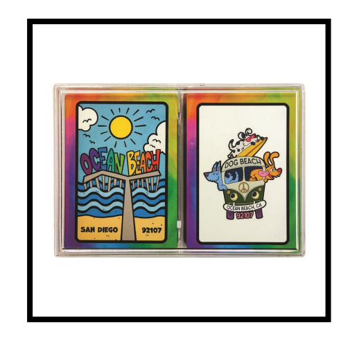
OB Playing Cards $17.95 + tax