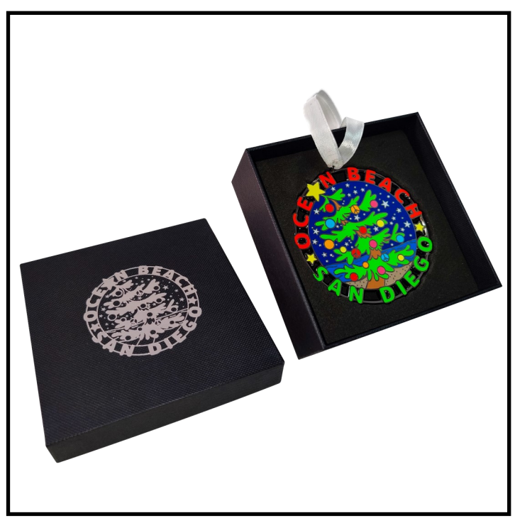
2022 OB Holiday Tree Ornament $25.00 + tax