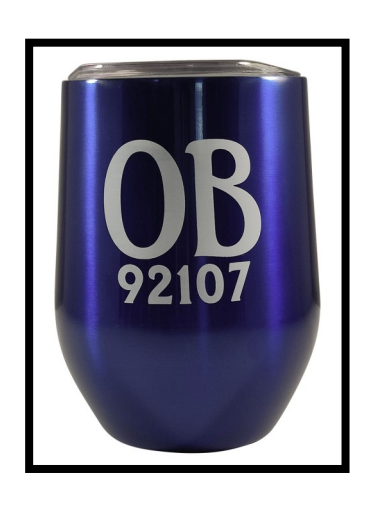
Double Insulated Tumbler $16.95 + tax