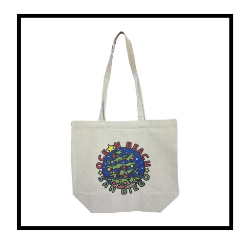
OB Holiday Tree Tote Bag $16.50 + tax