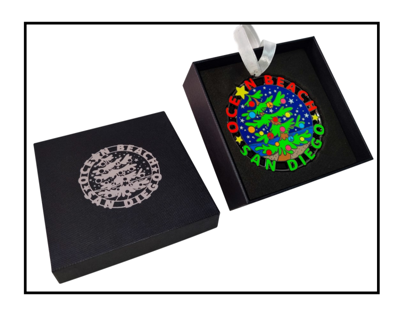
2022 OB Holiday Tree Ornament $25.00 + tax