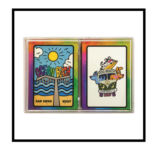
OB Playing Cards $17.95 + tax