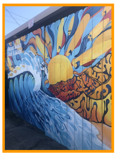
A bright sunny mural behind OB Surf and Skate in the alley between Newport Ave. and Santa Monica Ave.

Check out the new mural behind Shore Thing and The Black i n the alley between Newport Ave. and Niagara Ave.