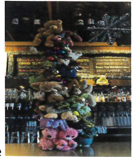
THC ~ South Beach Bar & Grille ~ Lighthouse Ice Cream ~ Raglan Public House